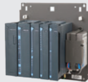
IRRInet ACE / XL