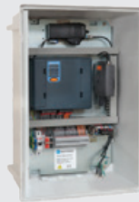
IRRInet M (Slave)